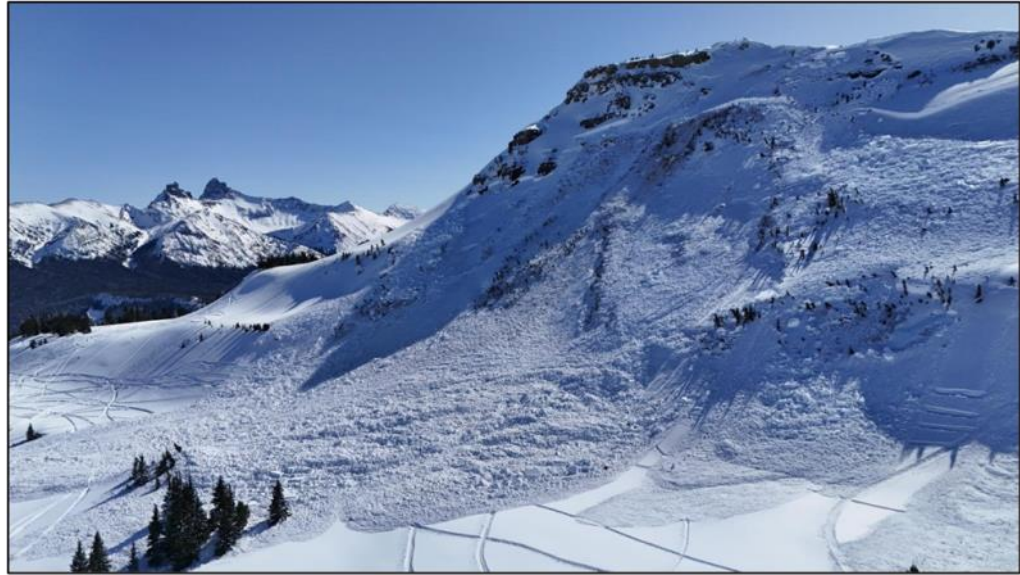
A snowmobiler triggered this huge avalanche on Henderson Mtn. near Cooke City on March 7.