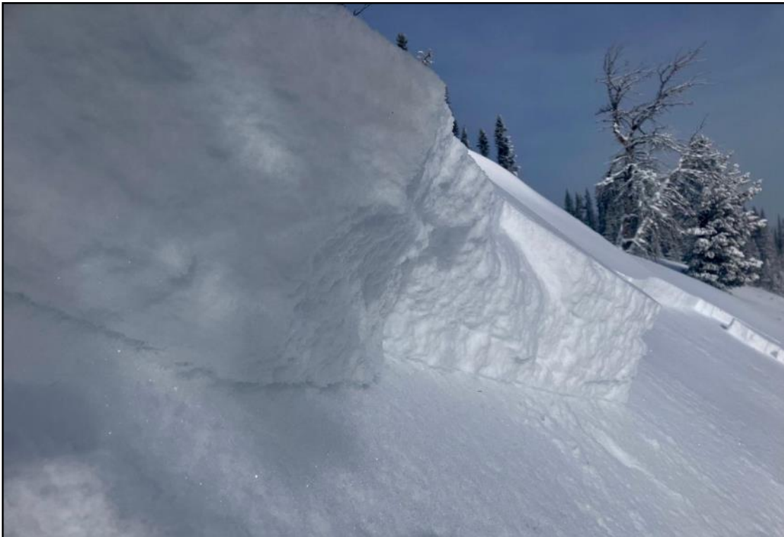
Avalanche we triggered from the flat ridge above as we walked towards the slope in Taylor Fork on

Danger was considerable to high for most of January, even when there was minimal or no new snow. Natural avalanches didn’t seem likely on many days, while human-triggered avalanches were likely to very likely. Despite naturals being less likely, there were still natural avalanches on days that had minimal or no new snow or wind-loading.