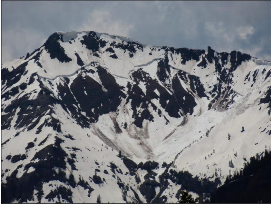
Natural wet slab avalanche south of Cooke City that happened on or within a couple days of June 10 .