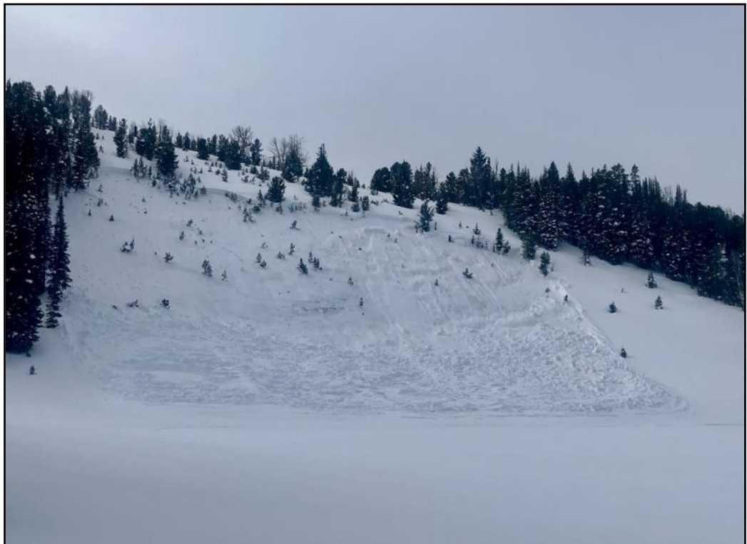
Riders triggered this avalanche from the flats near where the photo is taken, near Big Sky on February 17.