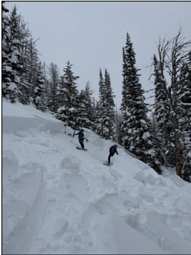
This large avalanche ran in a spot that we haven't seen slide, adjacent to a common skintrack at Bacon Rind, on March 2.

Throughout the season there were an average number of close calls or incidents compared to previous years. This winter we had 46 incidents reported which resulted in 16 people caught or carried, 9 partial burials and 3 injuries. Despite a historically scary snowpack, we are thankful there were zero avalanche fatalities in our forecast area.