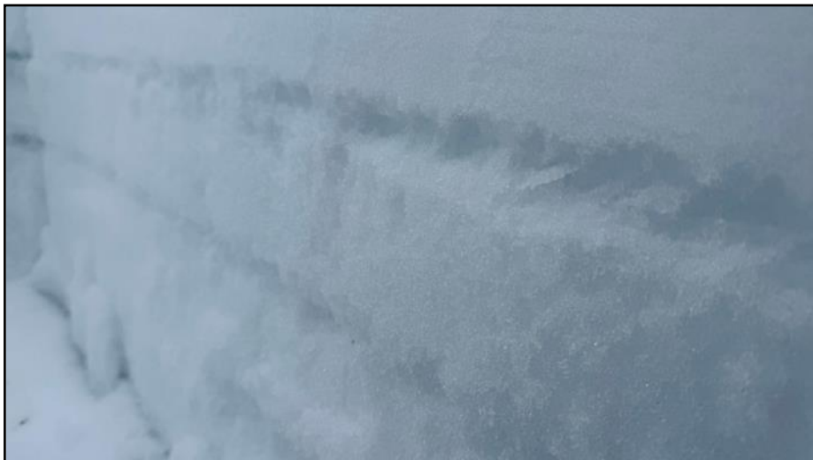
Multiple layers of buried surface hoar from early January produced avalanches all season.

hypothesize, persistent high pressure prevented normal, strong Montana winds and allowed widespread surface hoar to grow and survive in starting zones before being buried. Additionally, surface hoar and other weak layers formed during the shortest days of the year with many clear, long nights. This minimized sun exposure and warmth and promoted weak layer growth and survival on many slopes.